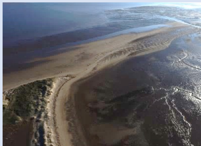
Coastal photogrammetry in practice

Climate change continues to disproportionately affect coastal areas which might change significantly in our lifetime. There are many stakeholders, including local government, wildlife trusts, offshore energy developers, and homeowners. Our research uses aerial photogrammetry and sedimentological analyses to quantify the impacts of tidal action and climatically-forced storm events on coastal morphologies.