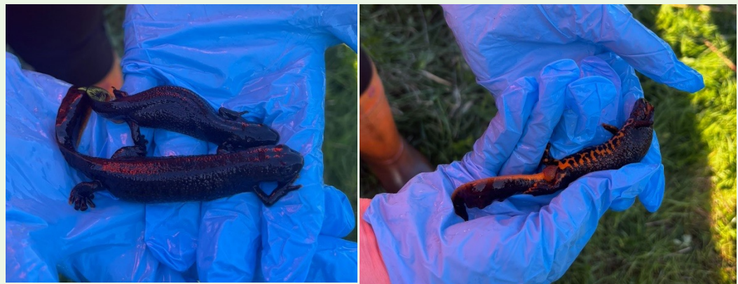
Fig 1 – Great crested newts caught by an ecologist using bottle traps. The identifiable orange belly is visible in the second photo.

Located on our school grounds is a balancing pond which is home to a population of great crested newts – which are an endangered species. Our research intends to analyse the ecosystem around the balancing pond to investigate the conditions which make this a suitable habitat for the newts, enabling us to monitor and help an endangered species to thrive.